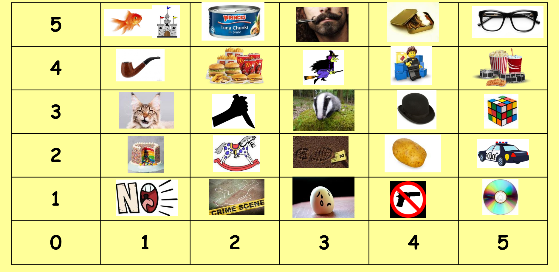
<u>Clue 4:</u> Unfortunately the detectives have muddled up evidence from different crime scenes.