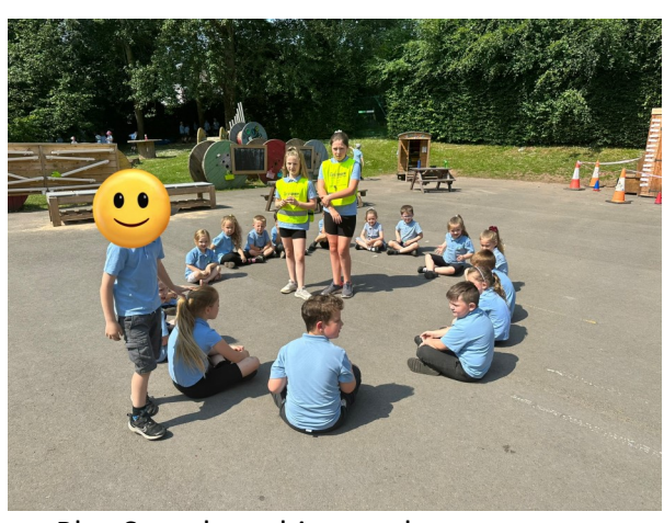
Play Squad teaching yard games to lower school.