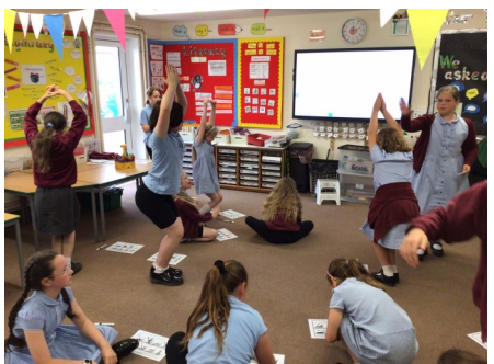
The Wellbeing pupil voice group "The Wellies" running a session of yoga bingo in Calm Club today.