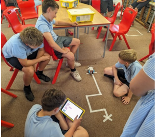
Year 5 & 6 were digital wizards when the Technocamps Team came in to teach building, coding and debugging.