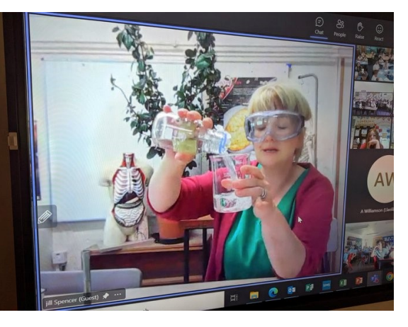
Year 6 had a live lesson from a science teacher in King Henry's.