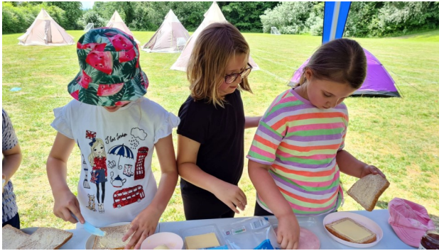
Children can make their own lunch mums and dads. And do the washing up after!!