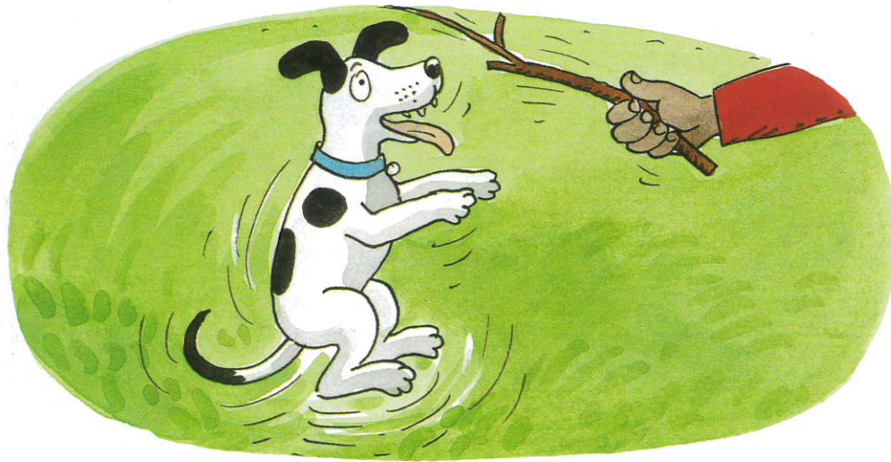
jump up for a stick ...