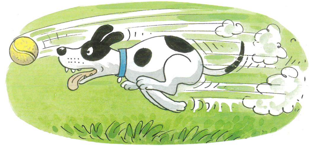
run after a ball ...