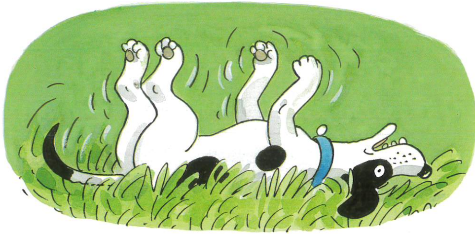
Sniff liked to roll on her back ...