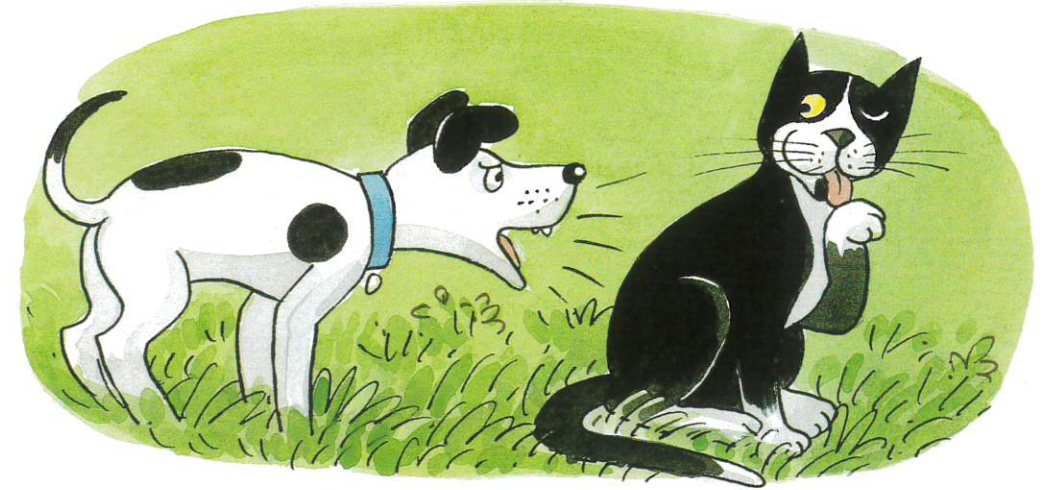
and bark at a cat.