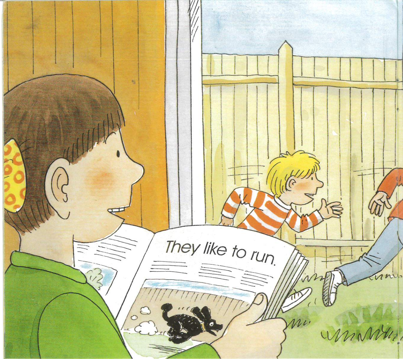
They like to run.