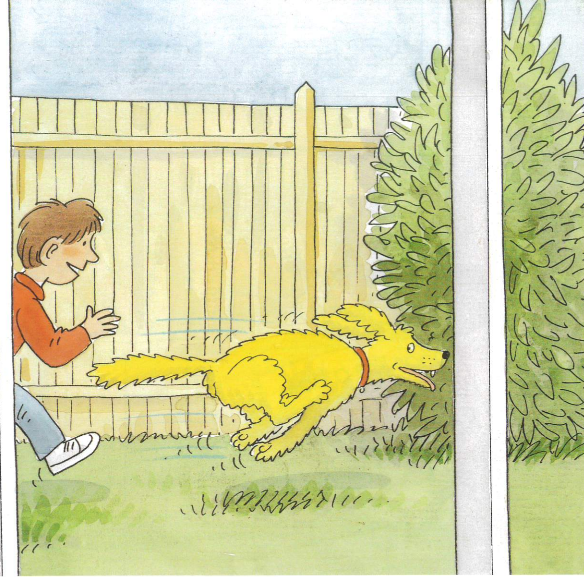
Floppy likes to run.