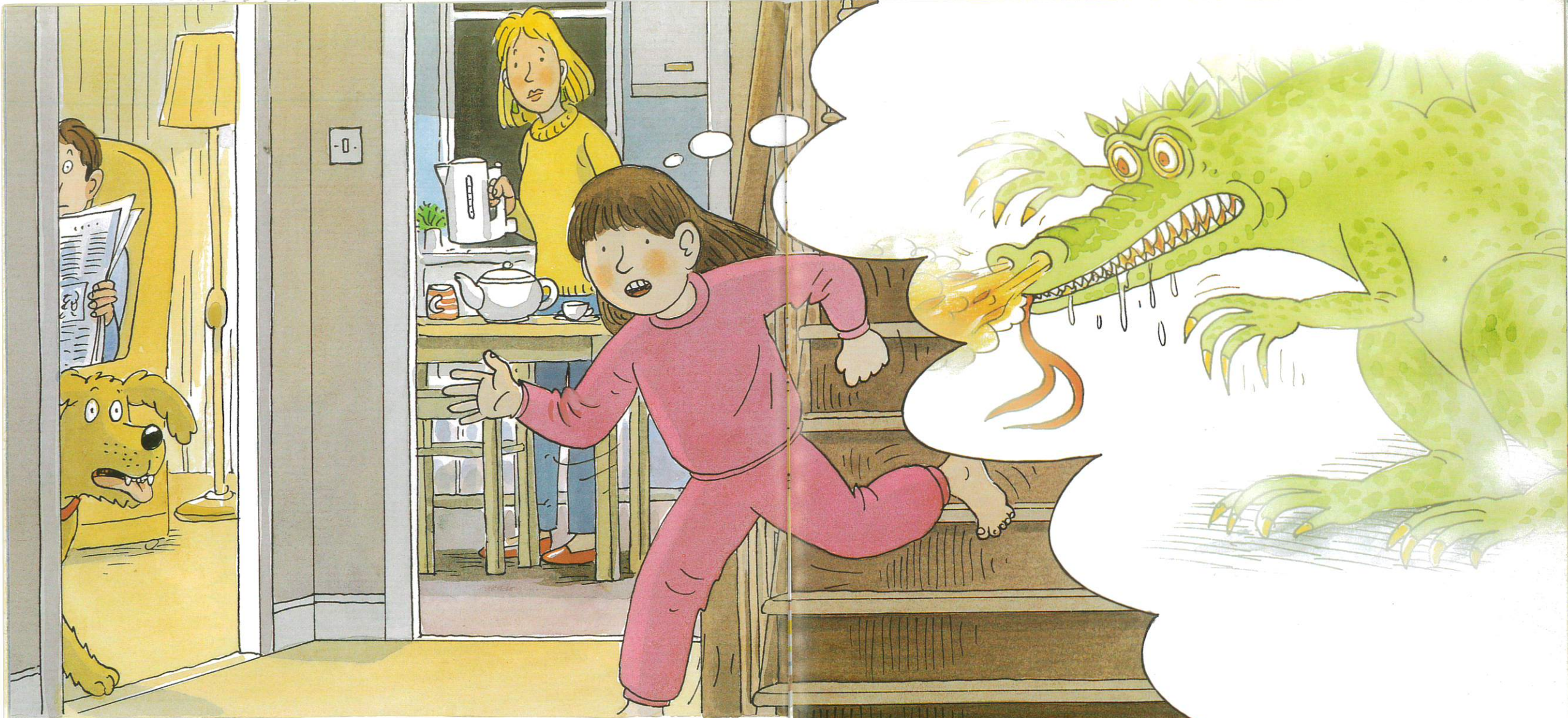
Biff went downstairs.