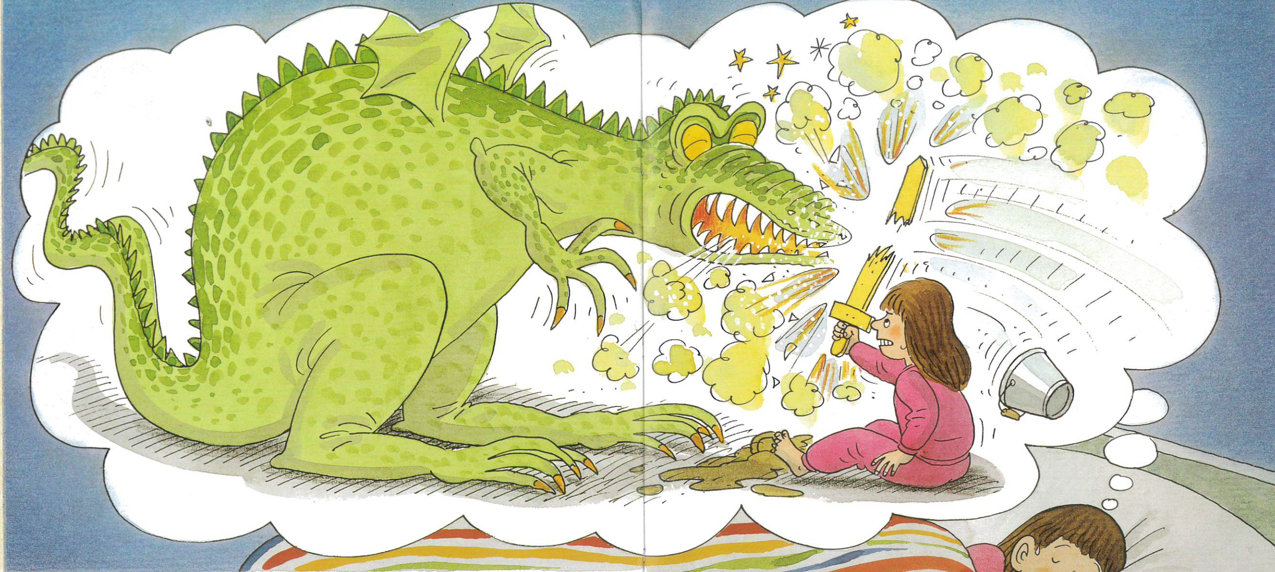
Biff had to fight it.